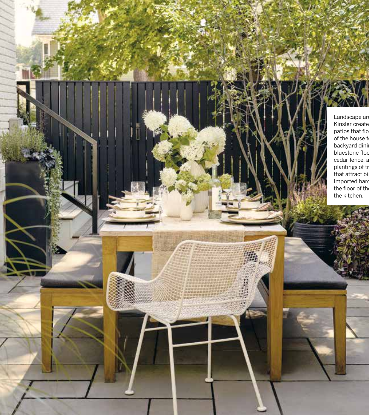
Landscape architect Terry Kinsler created a series of patios that flow from the side of the house to the back; the backyard dining patio has a bluestone floor, a black-painted cedar fence, and simple plantings of trees and flowers that attract birds. FACING PAGE: Imported hardwood forms the floor of the cozy patio off the kitchen.

ARCHITECTURAL DESIGN: Jannell Zarba, Damiana Design + Project Management