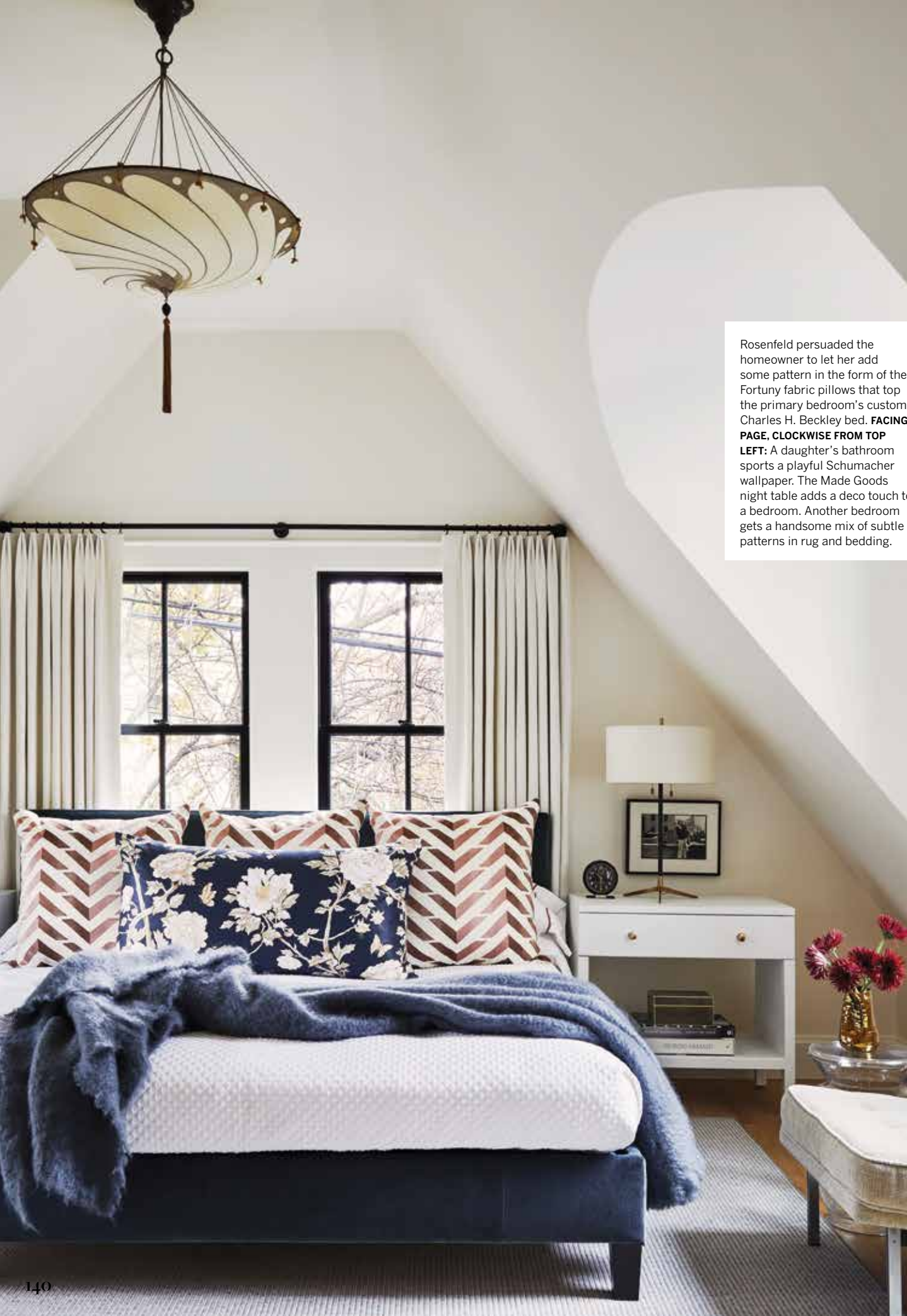
Rosenfeld persuaded the homeowner to let her add some pattern in the form of the Fortuny fabric pillows that top the primary bedroom's custom Charles H. Beckley bed. FACING PAGE, CLOCKWISE FROM TOP LEFT: A daughter's bathroom sports a playful Schumacher wallpaper. The Made Goods night table adds a deco touch to a bedroom. Another bedroom gets a handsome mix of subtle patterns in rug and bedding.