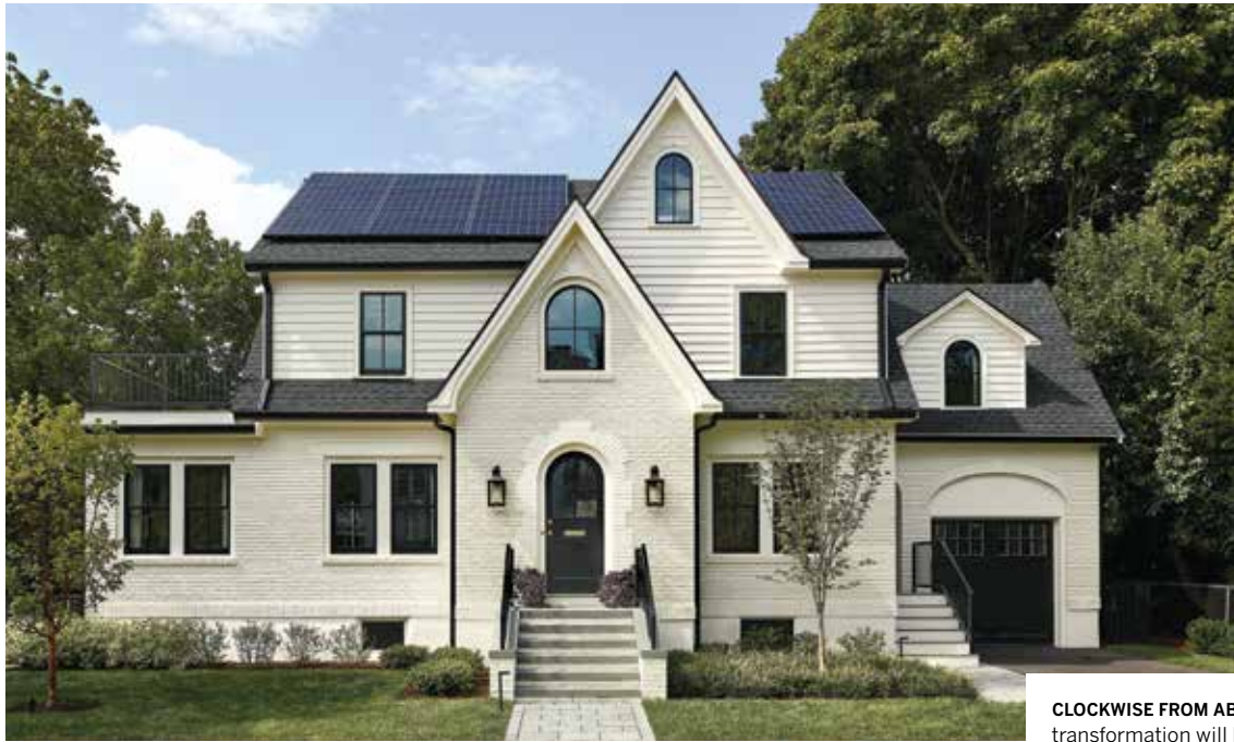
CLOCKWISE FROM ABOVE: The home's transformation will be featured in Collected by Sarah Richardson: Colour + Neutral (Simon & Schuster), due out in April. The airy sunroom, once a dark nook wedged behind a brick fireplace in the old living room, now provides a bright sitting area off the dining room. Lickie the pooch feels right at home in the sunny new kitchen. The hallway was the perfect spot for an enormous work of art the homeowner inherited from her father; it's all about texture—a white velvet sofa, tweedy ottomans, and a nubby rug—in the adjacent living room.