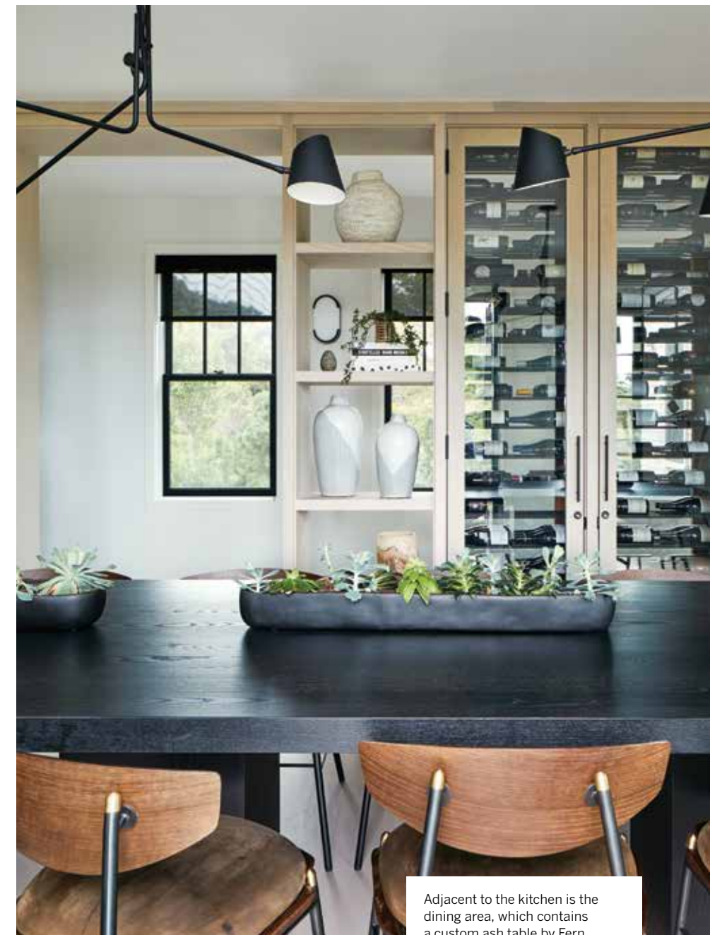
Adjacent to the kitchen is the dining area, which contains a custom ash table by Fern, chairs from Nuevo, and lighting from d’Armes. FACING PAGE: Workshop/APD also designed the interiors, creating a highly functional professional-style chef’s kitchen with oak cabinetry and flooring and durable stainless-steel countertops.

element of this project was delivering a design that caters to entertaining family.