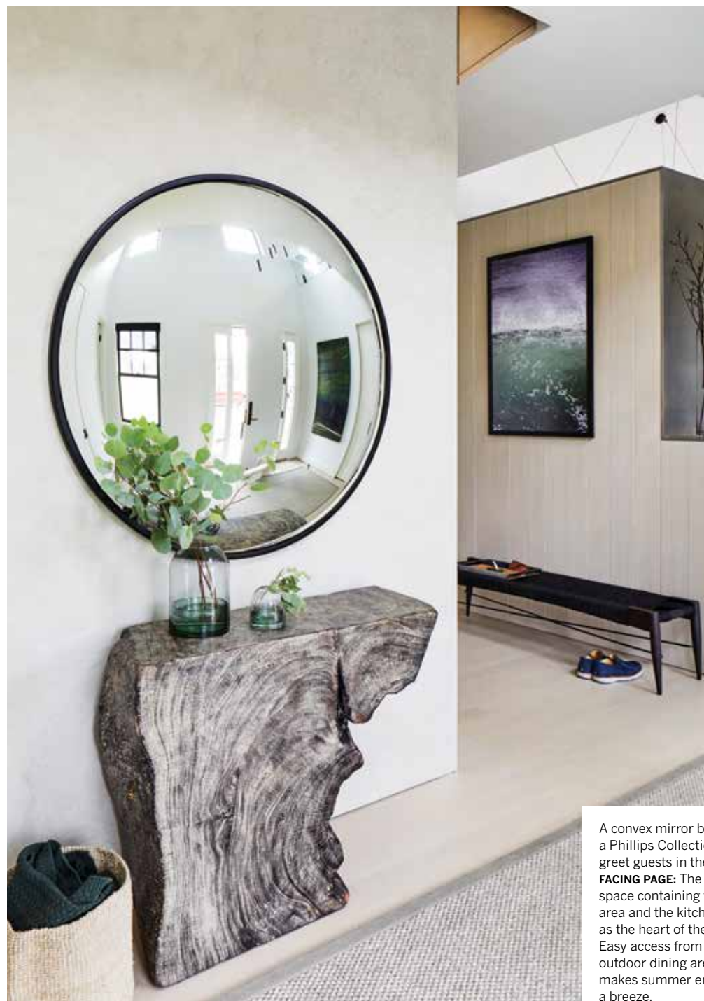
A convex mirror by RH and a Phillips Collection console greet guests in the entry. FACING PAGE: The soaring space containing the living area and the kitchen serves as the heart of the home. Easy access from here to the outdoor dining area and grill makes summer entertaining a breeze.