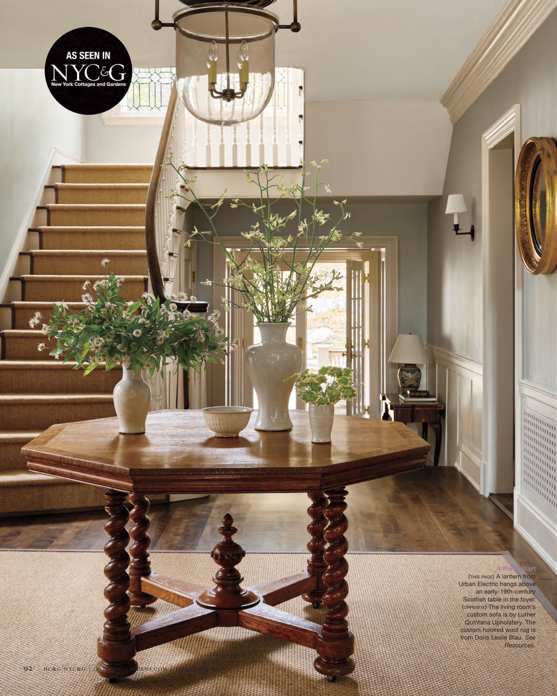
A Fresh Start (THIS PAGE) A lantern from Urban Electric hangs above an early-19th-century Scottish table in the foyer. (OPPOSITE) The living room's custom sofa is by Luther Quintana Upholstery. The custom hooked wool rug is from Doris Leslie Blau. See Resources .

AS SEEN IN NYC&G New York Cottages and Gardens