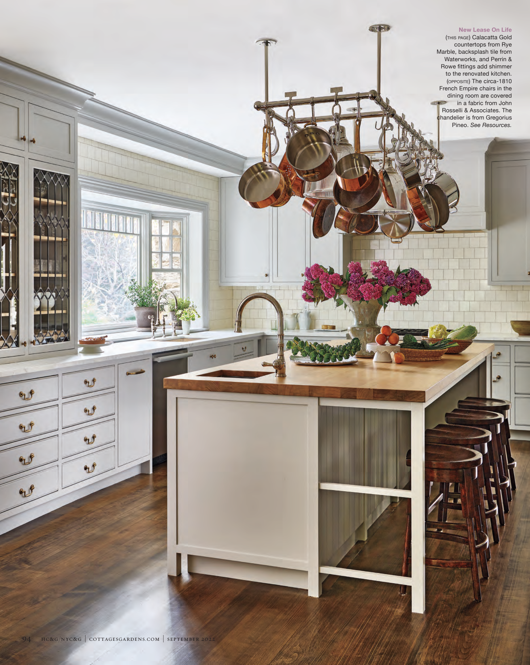
New Lease On Life (THIS PAGE) Calacatta Gold countertops from Rye Marble, backsplash tile from Waterworks, and Perrin & Rowe fittings add shimmer to the renovated kitchen. (OPPOSITE) The circa-1810 French Empire chairs in the dining room are covered in a fabric from John Rosselli & Associates. The chandelier is from Gregorius Pineo. See Resources.