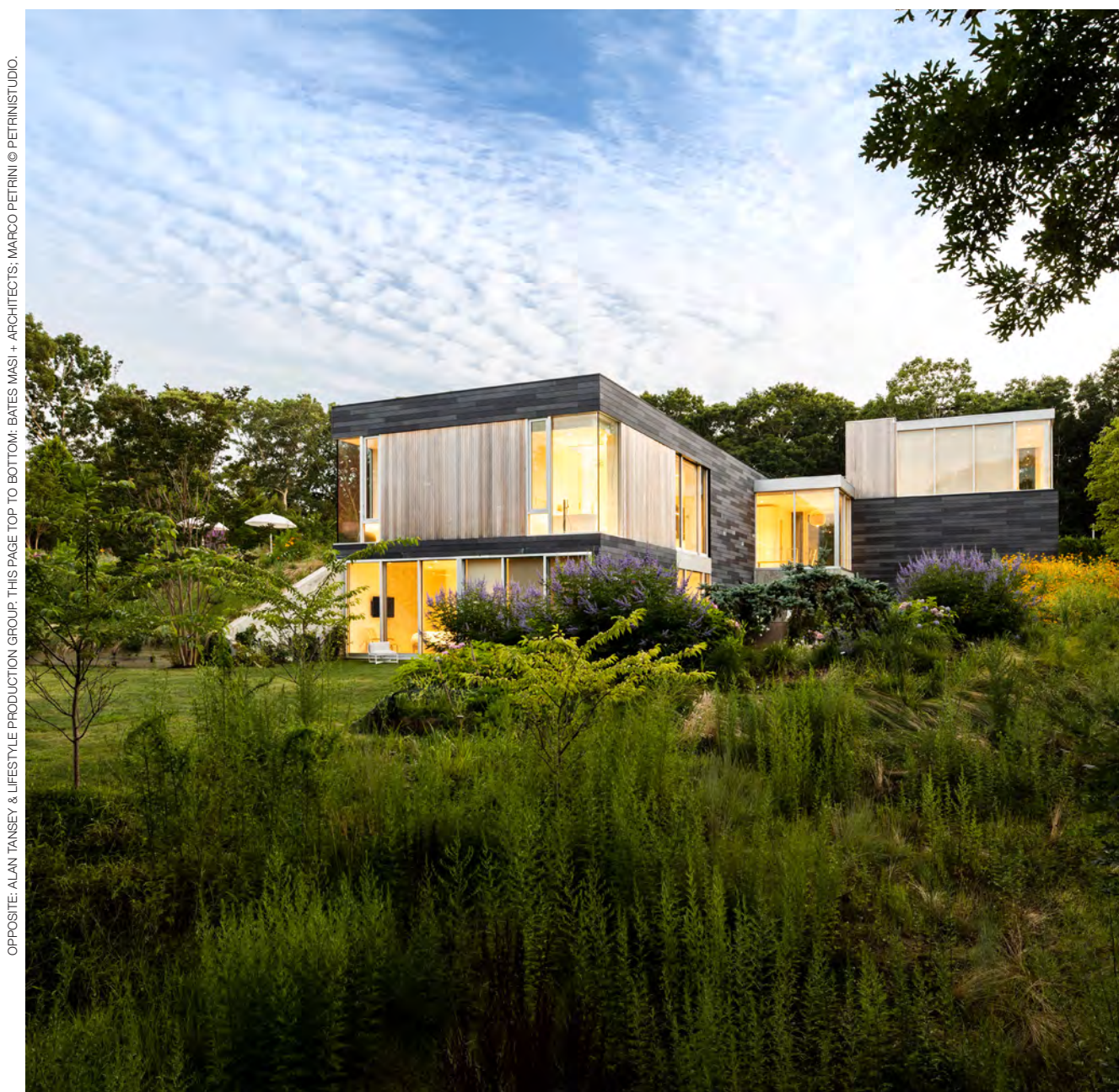
OPPOSITE: ALAN TANSEY & LIFESTYLE PRODUCTION GROUP; THIS PAGE TOP TO BOTTOM: BATES MASI + ARCHITECTS; MARCO PETRINI © PETRINISTUDIO.

In this Amagansett house, nature appears before your eyes with the push of a button. Expansive motorized sliding doors open from the living, dining, family, and kitchen areas to the yard, gardens, and pool. The clients asked for a modern house, and the architects obliged with a dynamic series of structured volumes comprising floor-to-ceiling glass walls juxtaposed with handsome, solid expanses that foster privacy. "I could live here," enthuses judge Rayman Boozer, who was struck by the house's "Taoist blending with nature."