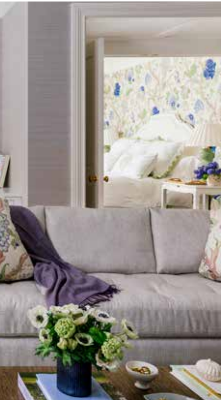
LEFT: A Phillip Jeffries hemp wallpaper brings informality to the master sitting room. The desk chair is covered in a Quadrille fabric. BELOW: The master bedroom is its own oasis, with walls in Clarence House Arbre de Vie wallpaper. Table, Hickory Chair. Lamp, Hwang Bishop. FOR MORE DETAILS, SEE RESOURCES