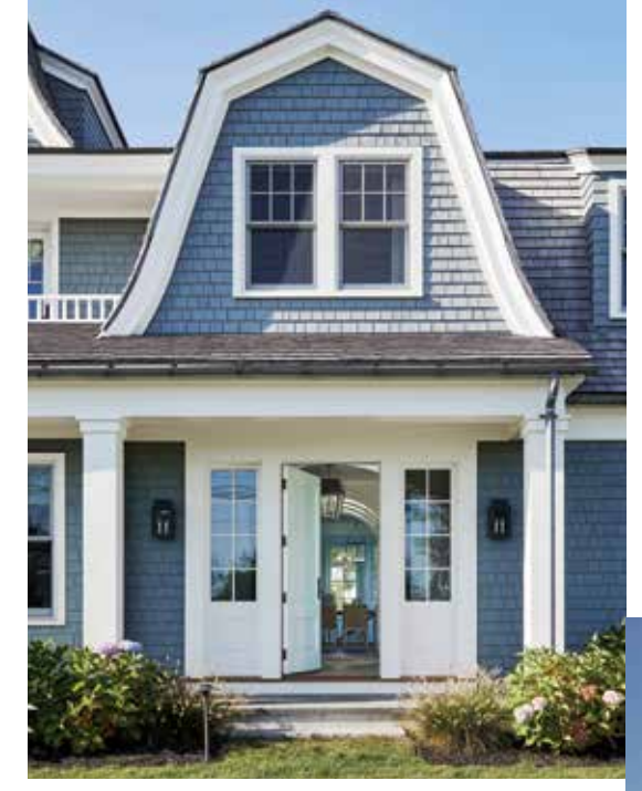
THIS PAGE, TOP TO BOTTOM: The front door is purposely understated, says architect Vincent Falotico. Tiered porches make the most of water views; the second-floor porch belongs to a casual family room. Built-ins, such as the breakfast area's banquette, give the home a ship-like quality. FACING PAGE: A Merida rug anchors the dining room, whose trim is painted Benjamin Moore's Yarmouth Blue cut by 50 percent.